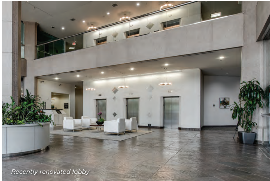
Recently renovated lobby