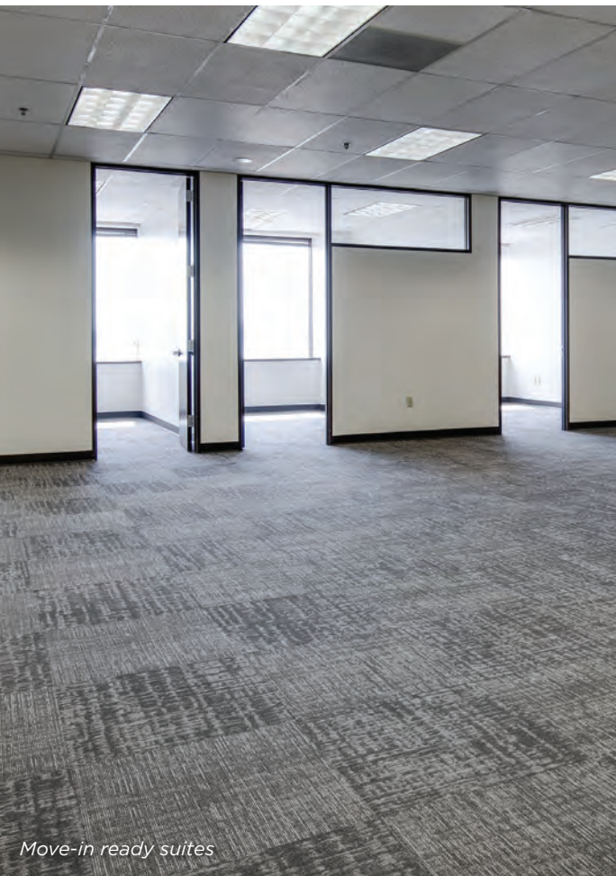
Move-in ready suites