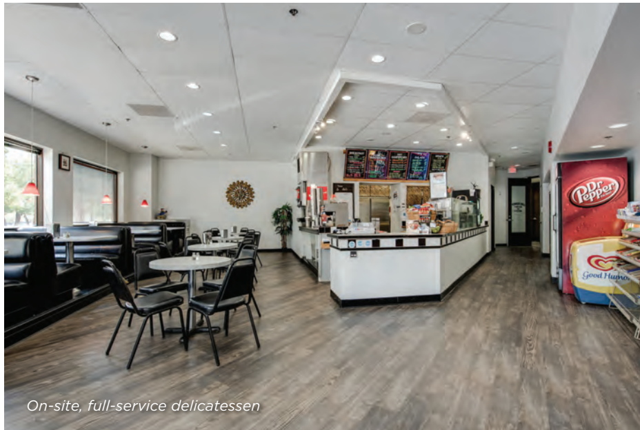
On-site, full-service delicatessen