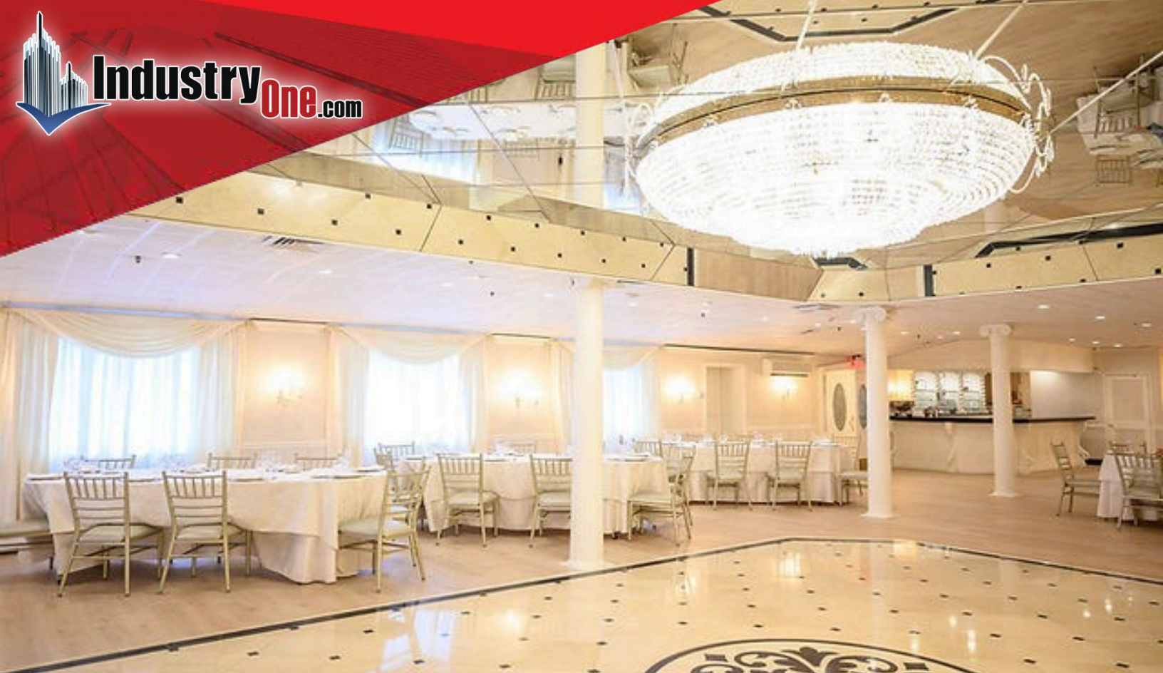
Ballroom (3,444 SF)