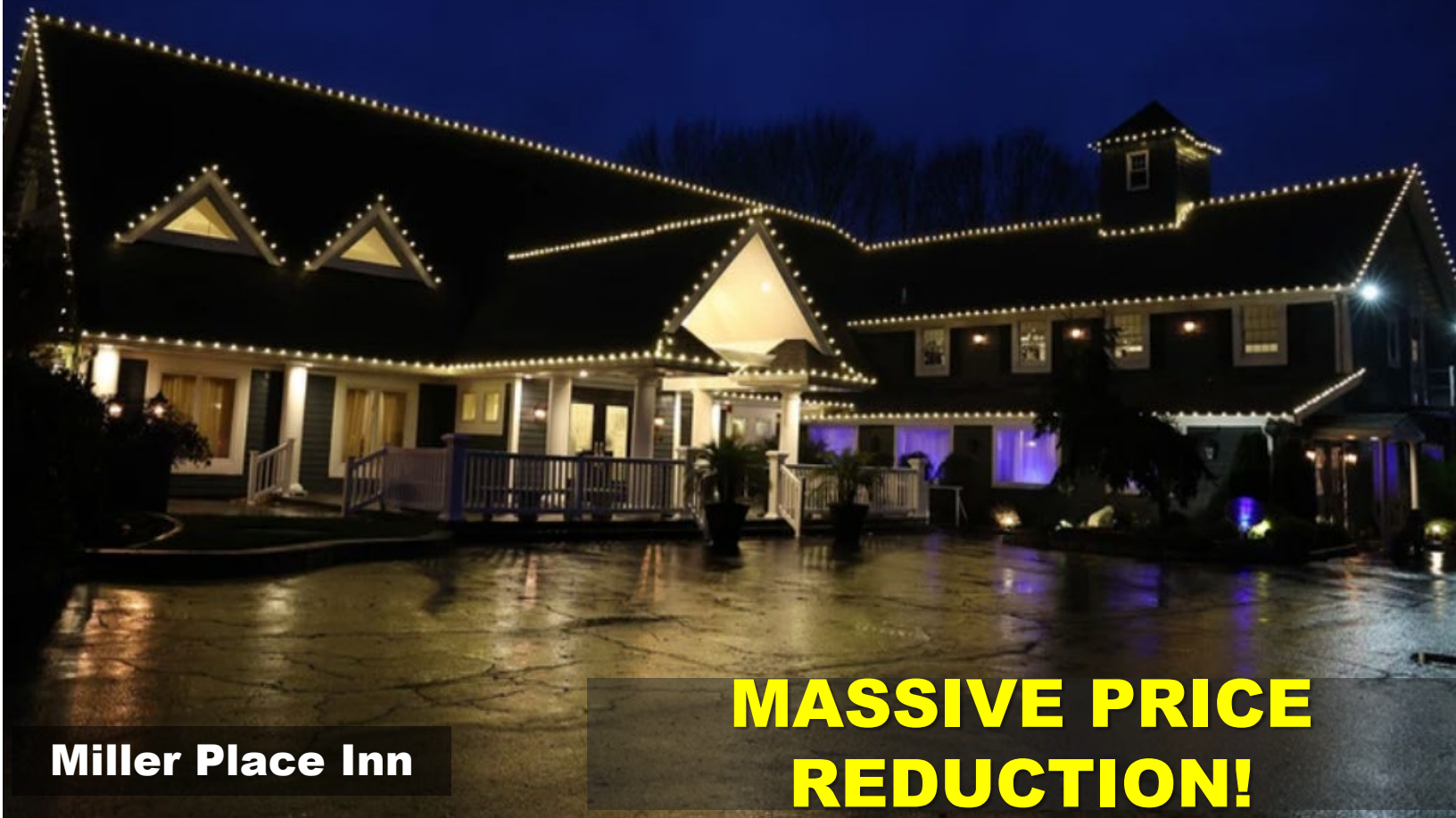
Miller Place Inn