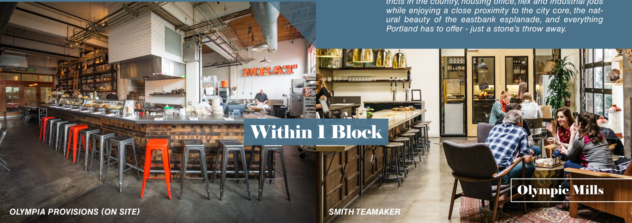
OLYMPIA PROVISIONS (ON SITE)

The Central Eastside Industrial District (CEID) extends to I-84 on the north, Powell Blvd on the south, and east-west between the Wilamette riverfront and SE 12th Ave. Preserved historic buildings are nestled between modern multi-story developments, and area residents and workers enjoy easy access to public transit and freeways. The Central Eastside Industrial District is an emerging hotspot for innovation and is one of the most unique districts in the country, housing office, flex and industrial jobs while enjoying a close proximity to the city core, the natural beauty of the eastbank esplanade, and everything Portland has to offer - just a stone's throw away.