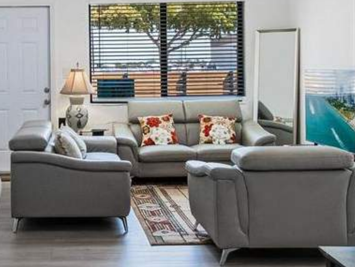
CASA BIANCA -TURN KEY MULTIFAMILY