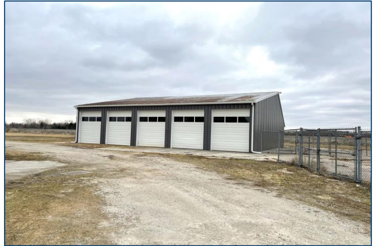
5 bay storage – 2,640 SF