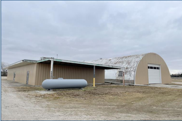
Retail building & Quonset hut