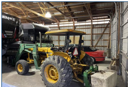
John Deere tractor