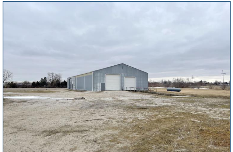
5,400 SF Storage building