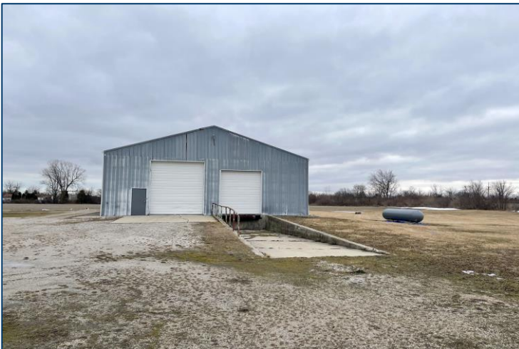
5,400 SF Storage