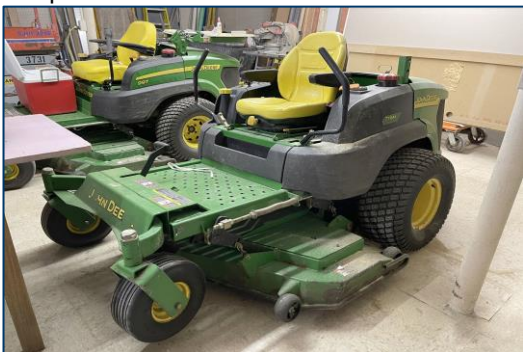
John Deere mower