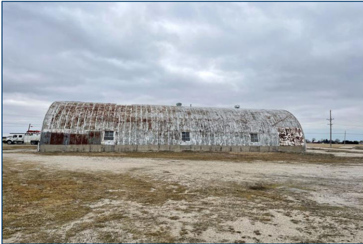
4,000 SF Quonset