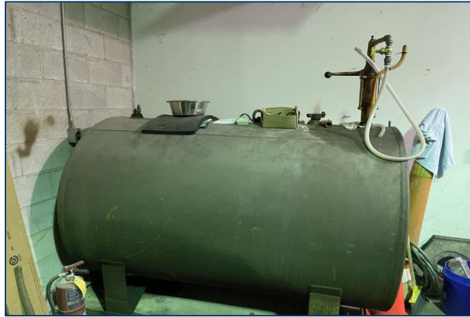
Diesel fuel tank