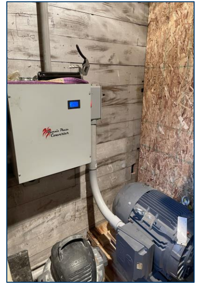
Meter room – inverter provides 3 phase power