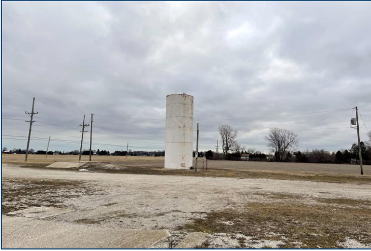
30,000-gallon water silo