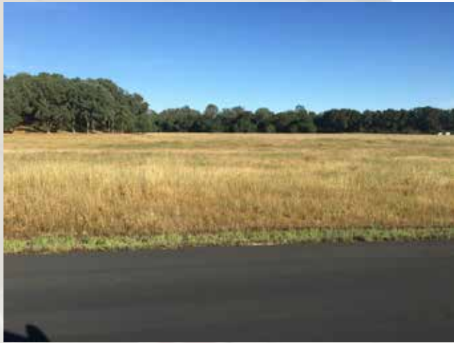
Lot 2 - ±34.6 Acres with meadow, oak woodland & taxiway/vehicular access in foreground

NEC Lambert Road & Eagles Ranch Road, Lone, Amador County, California