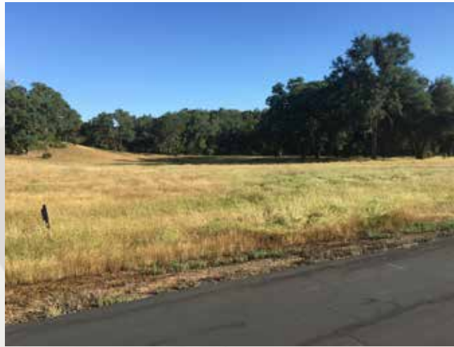
Lot 3 - ±25.34 Acres with meadow, oak woodland & taxiway/vehicular access in foreground