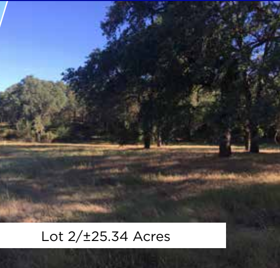
Lot 2/±25.34 Acres