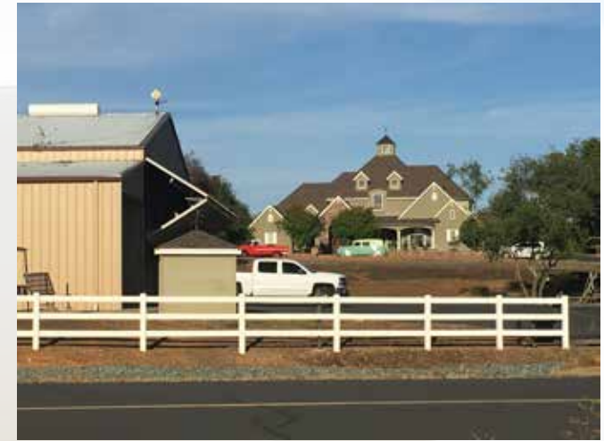
Neighboring estate home with aircraft hanger and taxiway in foreground