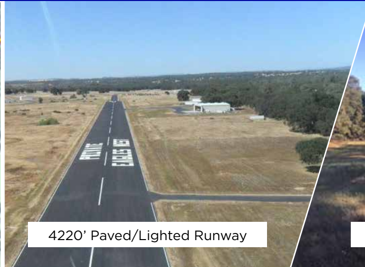
4220' Paved/Lighted Runway