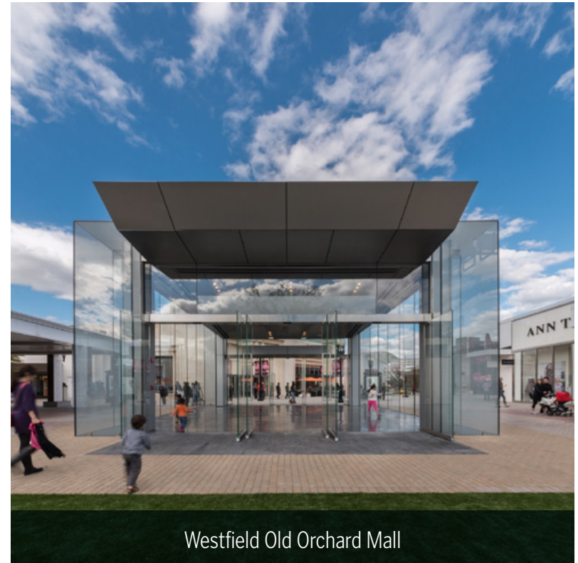
Westfield Old Orchard Mall