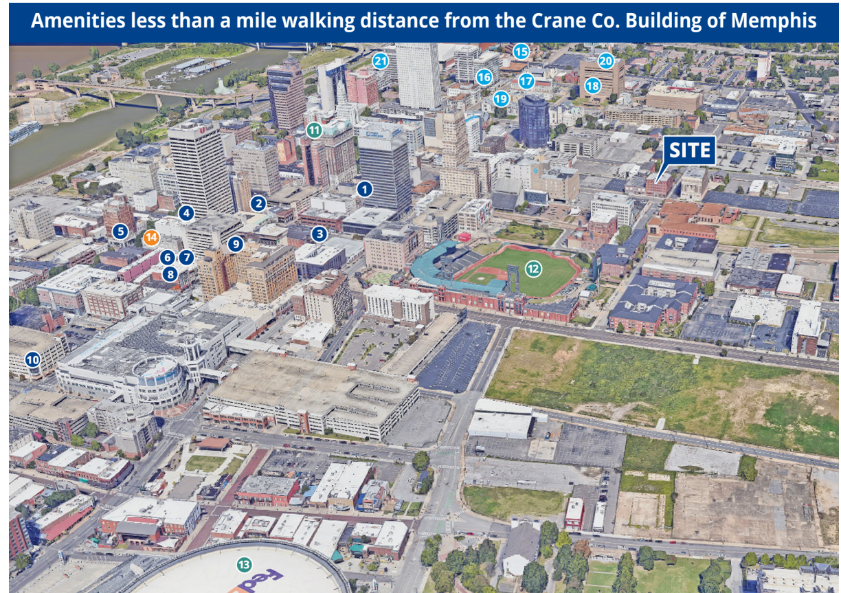
Amenities less than a mile walking distance from the Crane Co. Building of Memphis

Located at the corner of 4th Street and Court Avenue, this property is within walking distance to the Shelby County Courthouse and Criminal Justice Center, making it the ideal office location for those in the legal field.